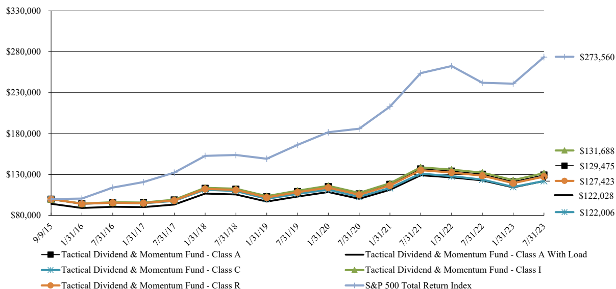
Comparison of the Change in Value of a $100,000 Investment